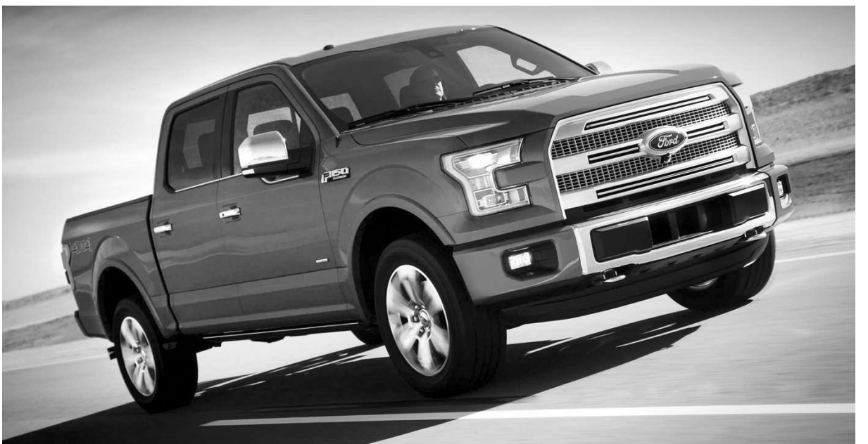
From its tailgate step to the LED spotlights found on the side mirrors, the next-generation 2015 Ford F-150's new features and technologies make it the most patented truck in company history.