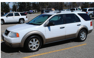
2005 FORD FREESTYLE AWD, 3rd row seat. SALE PRICE $1,995