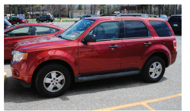
2012 FORD ESCAPE XLT Nice! AS LOW AS $199 A MONTH