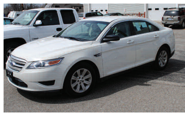
2011 FORD TAURUS Steering wheel controls. Very nice vehicle. AS LOW AS $219 A MONTH