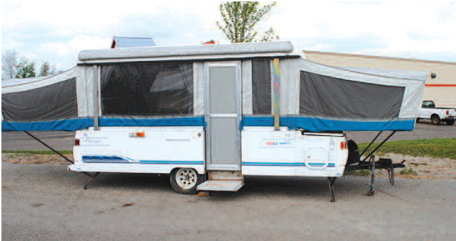
Used 1996 Coleman Pop-Up Camper Sale $2,995

SUGG. PRICE: $23,500 YOU SAVE: $6,505 Sale $16,995 PAYMENTS AS LOW AS $169 A MONTH