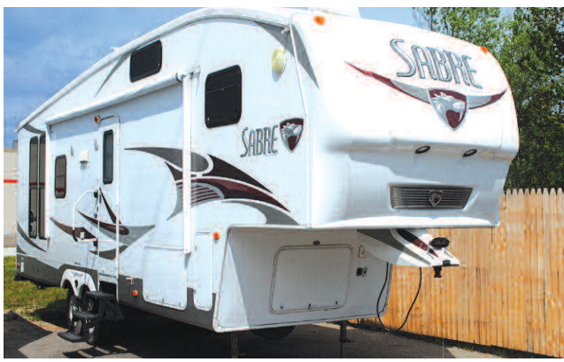
Used 2010 Sabre by Palomino 31REDS-6 Fifth Wheel.

SUGG. PRICE: $12,995 YOU SAVE: $4,000 Sale $8,995 PAYMENTS AS LOW AS $99 A MONTH