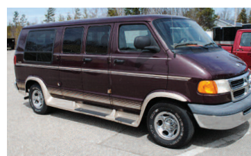
2000 DODGE RAM CONVERSION VAN As is. Save $500 this week. ONLY $2,495