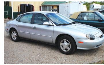
1999 FORD TAURUS Nice car, low, low price. SALE PRICE $1,995