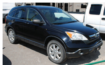
2007 HONDA CR-V EX 4WD, 28 MPG, sunroof, tow pkg. AS LOW AS $169 A MONTH