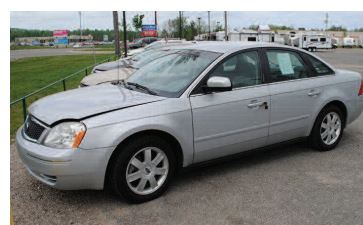
2005 FORD 500 AWD, 102 K. Great family car. AS LOW AS $169 A MONTH