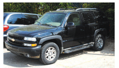
2004 CHEVY TAHOE Z-71 4WD, leather, 3rd row seat, power moonroof. SALE PRICE $9,995