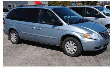
2006 CHRYSLER TOWN & COUNTRY Seats 7, dual sliding doors, 25 MPG. SALE PRICE $9,995 AS LOW AS $129 A MONTH