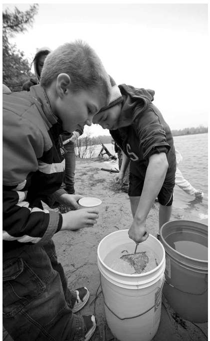
Students from Whitefish Township Community School eagerly help transplant fish at the mouth of the Tahquamenon River in Tahquamenon Falls State Park, near Paradise. The students raised the fish from egg to fry as part of the Department of Natural Resources’ Salmon in the Classroom program.

The program, begun by a DNR fisheries biologist as something of a lark in the mid-1990s, is now in some 230 schools, engaging students from upper elementary through high school. Some schools have hundreds of stu-