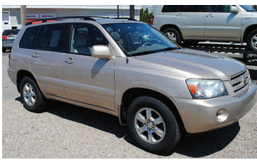
2004 TOYOTA HIGHLANDER 4WD, 3rd row seat. AS LOW AS $159 A MONTH