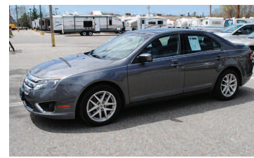
2011 FORD FUSION SEL 28 MPG, leather. Only 61 K. Looks and drive like new. AS LOW AS $199 A MONTH