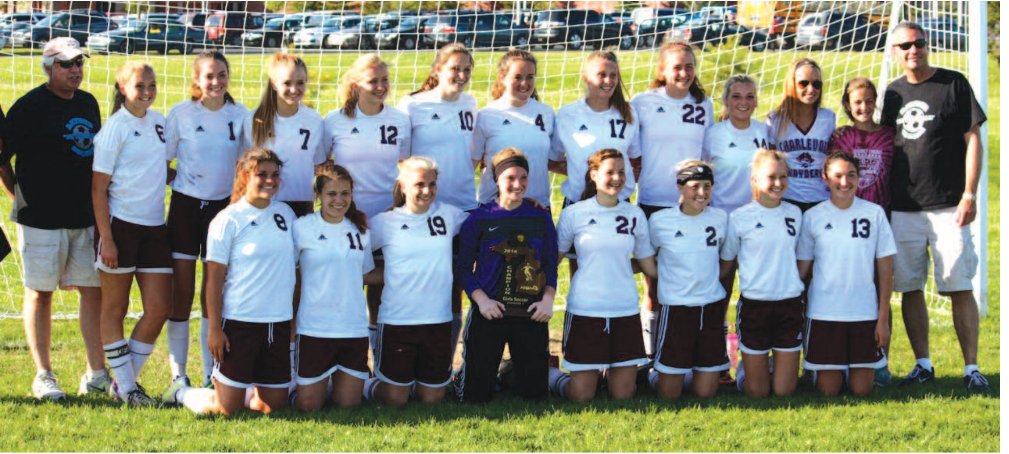
The Charlevoix Rayder girls soccer team poses with their district championship.