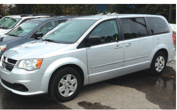
2011 DODGE GRAND CARAVAN Slow-n-Go, 4 captain chairs, seats 7, steering wheel control. Only 63 K. AS LOW AS $199 A MONTH