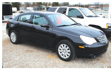
2007 CHRYSLER SEBRING LX Nice looking car. 27 MPG. SALE PRICE $6,995