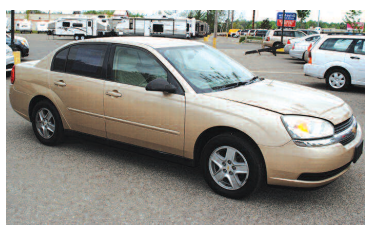
2005 CHEVY MALIBU 32 MPG, 4 door. AS LOW AS $149 A MONTH