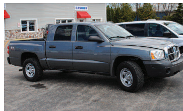
2006 DODGE DAKOTA 4 DOOR 4x4, bedliner, tow pkg, sunroof, 96 K. AS LOW AS $149 A MONTH