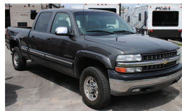
2001 CHEVY SILVERADO 2500 HD 4WD Crew cab, 4 dr., leather, bedliner, tow pkg. Only 87 K. AS LOW AS $199 A MONTH