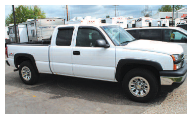
2006 CHEVY SILVERADO 1500 LT3 4x4, ext. cab, bedliner, seats 6, tow pkg, Pioneer sound. AS LOW AS $229 A MONTH