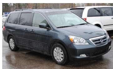
2005 HONDA ODYSSEY Touring pkg, leather, heated seats, loaded. REDUCED TO $9,995!