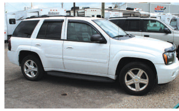
2008 CHEVY TRAILBLAZER LT3 4WD, leather, sunroof, tow pkg. Only 75K. SALE PRICE $15,995